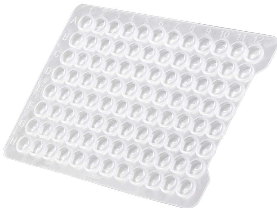
Cod: 243114 capmat for Plate medio